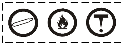
Canadian Hazard Symbols