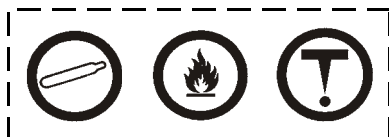
Canadian Hazard Symbols